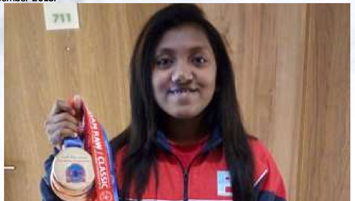
Keeping track of your time